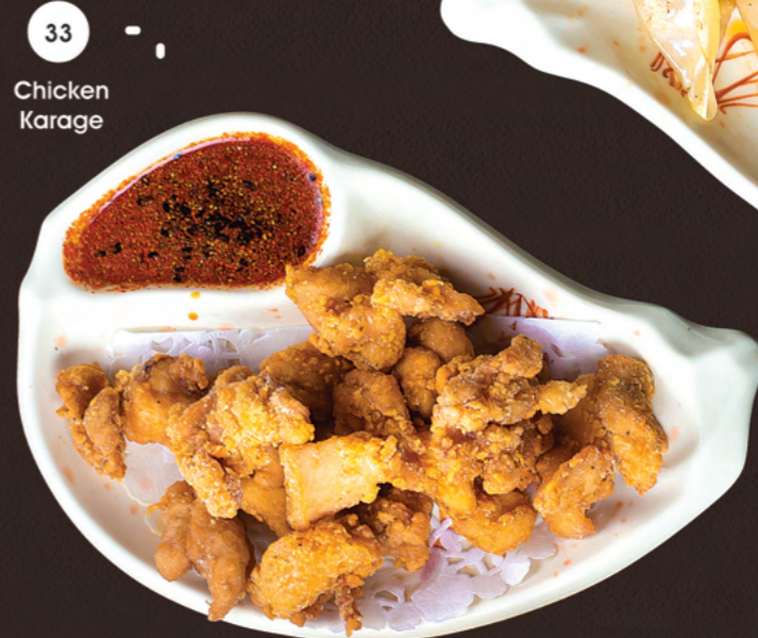
33 Chicken Karage