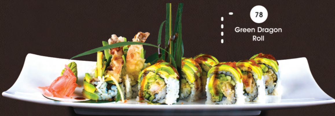
Green Dragon Roll