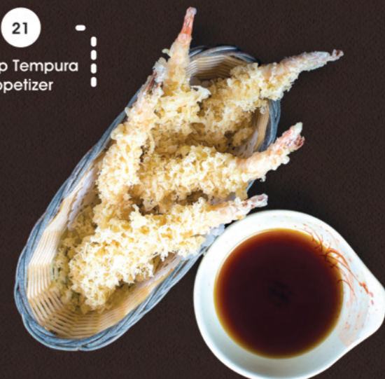
21 Shrimp Tempura Appetizer